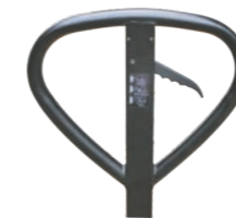
*Standard: metal handle