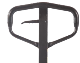
*Option: rubber wrapped handle