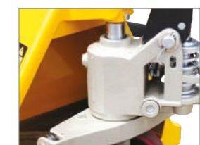
Integrated cast pump