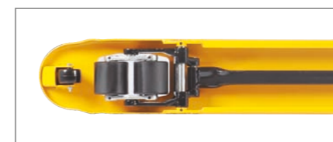
Standard with entry & exist Roller (option with single or double fork rollers)